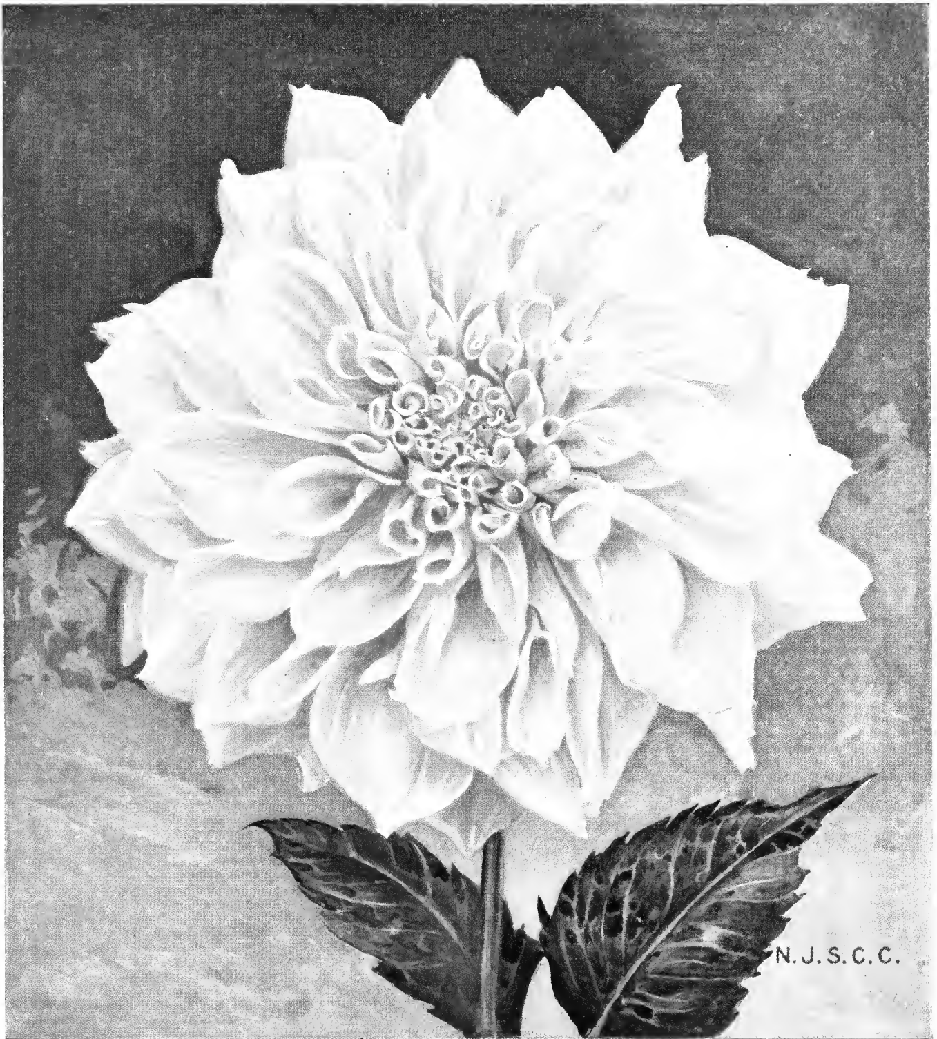
New Jersey State Chamber of Commerce. Type of Bashful Giant